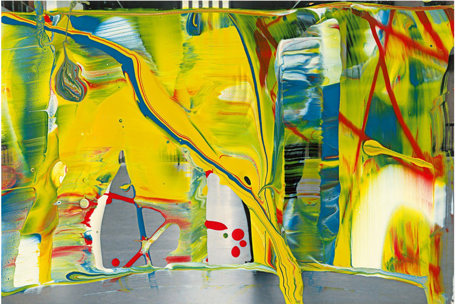
Plate 4. Gerhard Richter. MV. 92 (2011). Oil on color photograph.