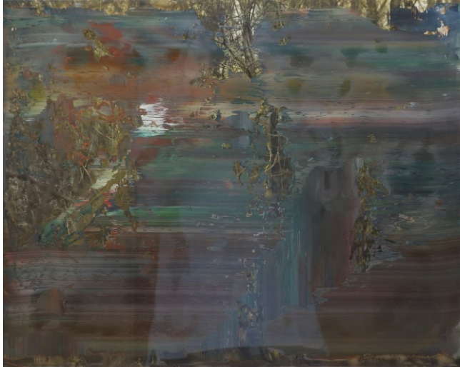
Plate 1. Gerhard Richter. 3. Jan. 1990 . Oil on black-and-white photograph.