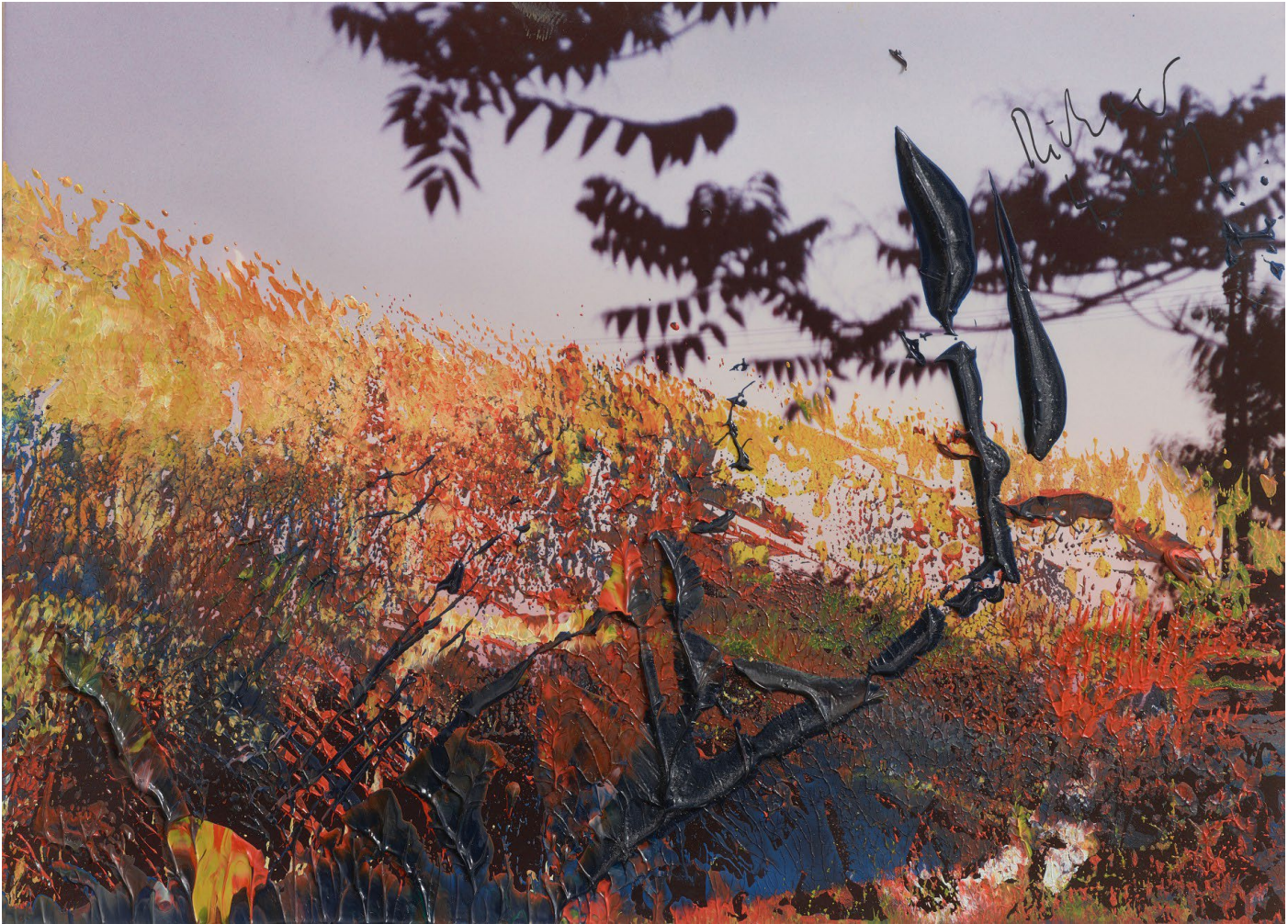
Plate 3. Gerhard Richter. 4. Jan. 1989 . Oil on color photograph.